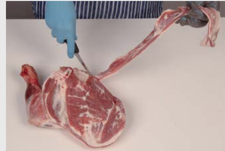
3. Trim excess fat to create a round shoulder.