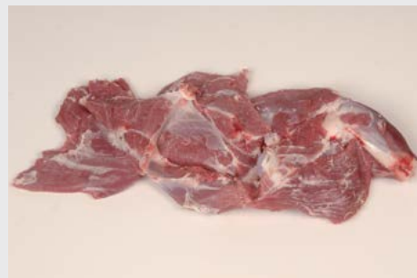
6. cartilage attached to the shoulder muscles.