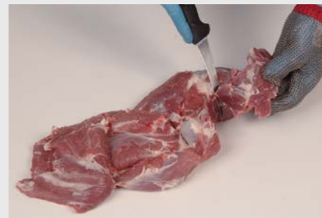
7. Remove the meat from the shoulder taking care