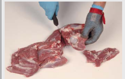
8. to leave enough meat on the bones