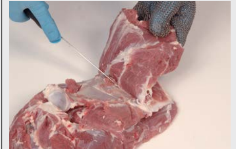
4. cut between the joints and remove the