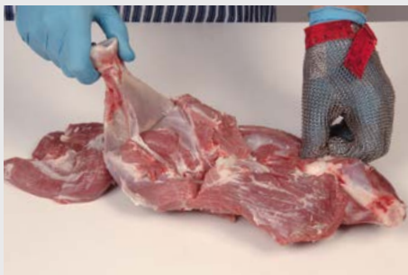
5. shoulder blade, but leaving the blade bone